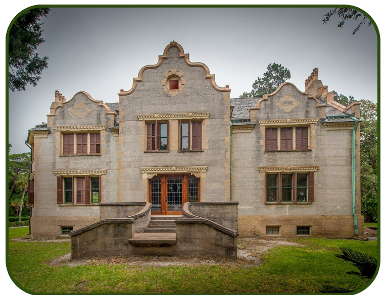
Hollybourne Cottage—Front Entrance