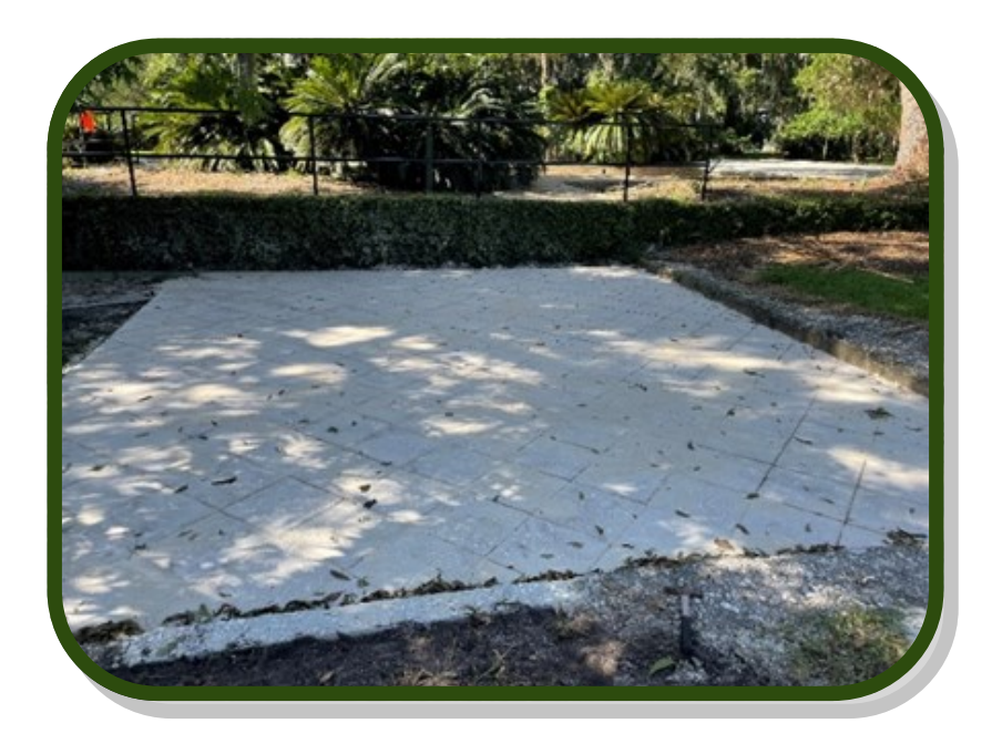
Work being done on Chichota Ruins

We saw numerous improvements to structures in the Historic District, most notably the completion of the paving phase of the Chichota Ruins.